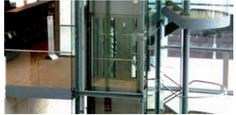
ELECTRIC MACHINE ROOMLESS LIFT

Note: See our website www.mpelevacion.com for shaft dimensions.