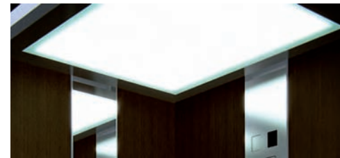
The L90-ECO ceiling has a long-lasting, high-intensity, clean and uniform light.