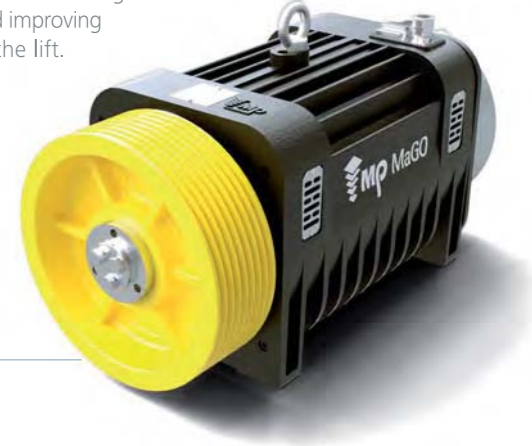
MaGO MACHINE Gearless machine with a permanent magnet synchronised motor.

MPGO! also incorporates new materials into its design which focuses on reducing vibrations and improving the comfort of the passengers inside the lift.