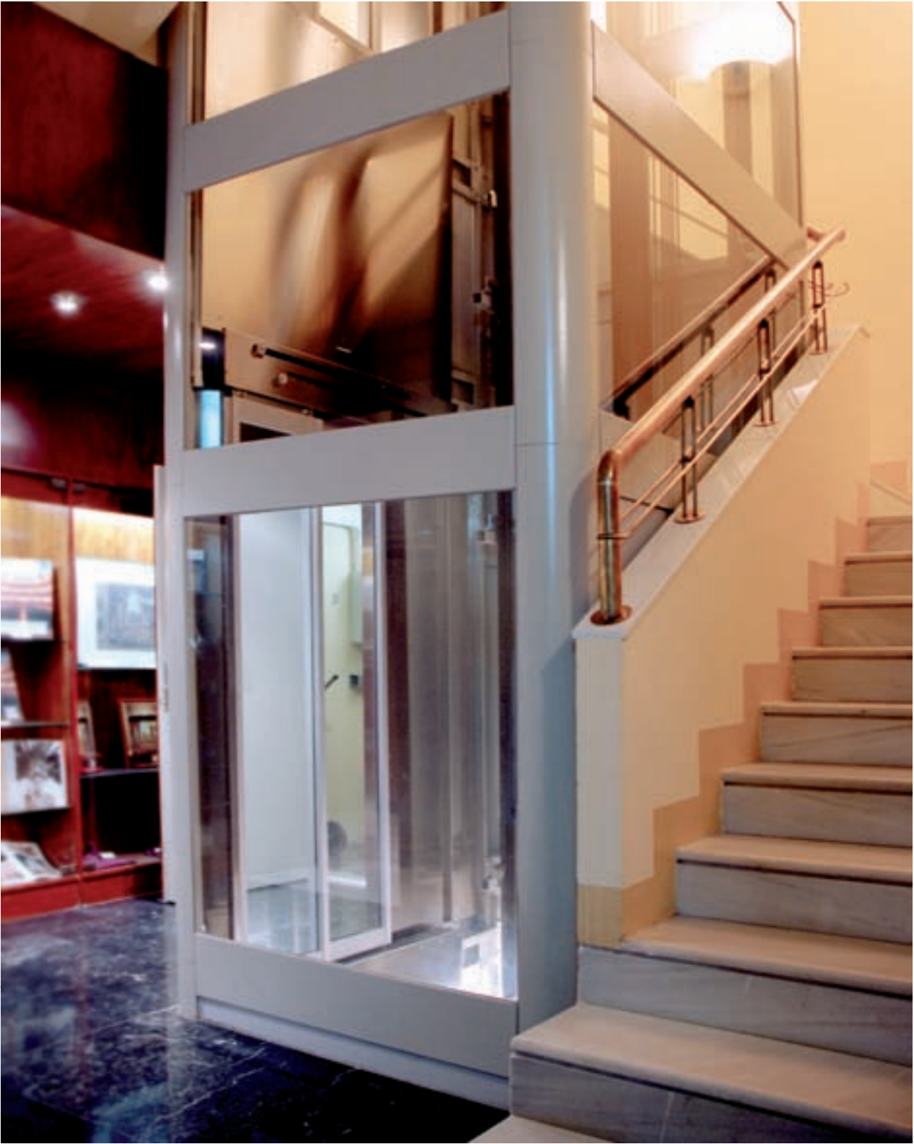
MP STRUCTURA Fortuny Theatre Tarragona. Spain.

FOR THE TRANSPORT OF PASSENGERS IN EXISTING BUILDINGS WITHOUT LIFT