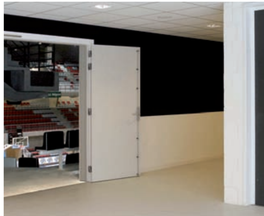
MP STRONGO lift Country Hall Ethias Liege, Lieja, Bélgica

Since in our daily life agility means profitability, MP has designed MP STRONGO lift line to provide solutions for vertical goods transport . A lift conceived to withstand high traffic levels and large sized loads. Its robust structure guarantees a safe transport of heavy loads ; a strength that can also be flexible. A wide range of options allows MP STRONGO lift to be adapted to multiple uses in all types of buildings: stores, hotels, factories, airports, supermarkets, large shopping areas, hospitals.